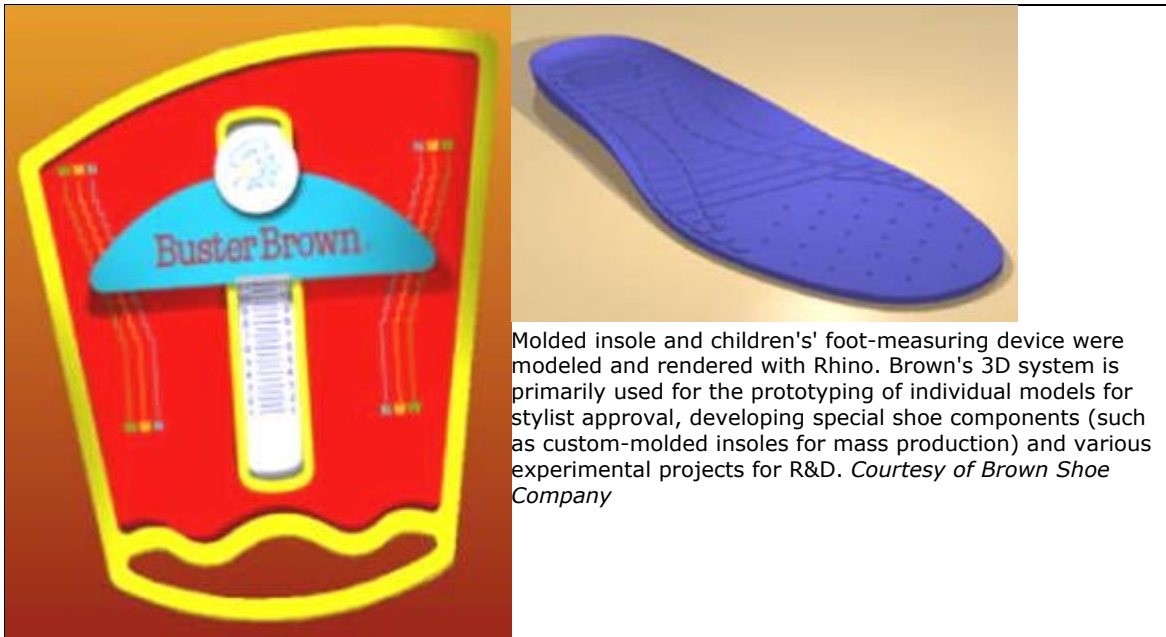
Molded insole and children's' foot-measuring device were modeled and rendered with Rhino. Brown's 3D system is primarily used for the prototyping of individual models for stylist approval, developing special shoe components (such as custom-molded insoles for mass production) and various experimental projects for R&D.

One of the first to take advantage of the Rhino-MecSoft partnership is Brown Shoes, one of the largest shoe retailers in the U.S. The company recently conducted a comprehensive search to replace its outdated Unix-based system with a new PC-based 3D CAD/CAM system.