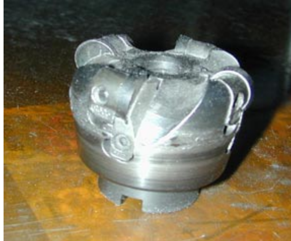
60 mm insert cutter used to rough out the large steel dies used for casting aluminum parts.

The picture below shows the core parts of two dies that are machined out of foam. VisualMill's roughing toolpath methods were used to create the toolpaths for these models. These models were machined out of foam and ren material. Due to contractual restrictions with their suppliers we are unable to show the actual steel models that were produced.