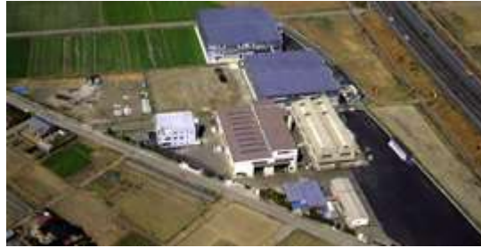
Located in bustling Toyoda City, Sugiyama Industries main plant supplies parts to leading automotive and aerospace companies such as Toyota and Misubishi.

Sugiyama Industries was founded in 1921 and for more than eighty years the company has been continuously in the forefront of manufacturing technology. Its main production plant is located in the Japanese heartland in blue collar Toyoda City. It is now a leading supplier in the Japanese automotive industry supplying parts to both Toyota and Mitsubishi. The company consists of two main divisions, the Mold and Die division and the Automotive Parts Division. The Mold and Die division is involved in making steel dies for aluminum castings for automotive parts such as engine and transmission components, while the Automotive Parts Division is focused on the design and manufacturing plastic parts for the automotive industry.