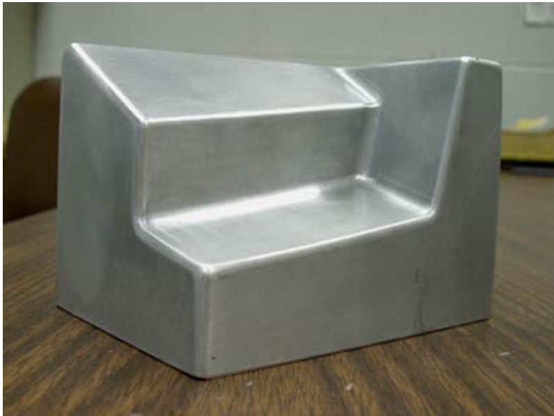
Figure 1 and 2 – A tooling for automotive parts developed at Advanced Machine Tool.