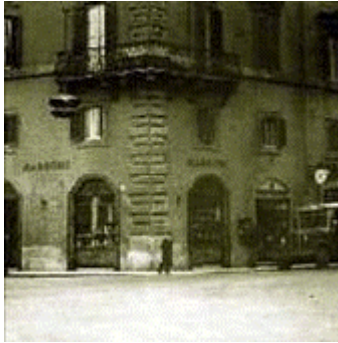
The Massoni store in the mythical Via Condotti, on the corner with Largo Goldoni, Roma, Italy