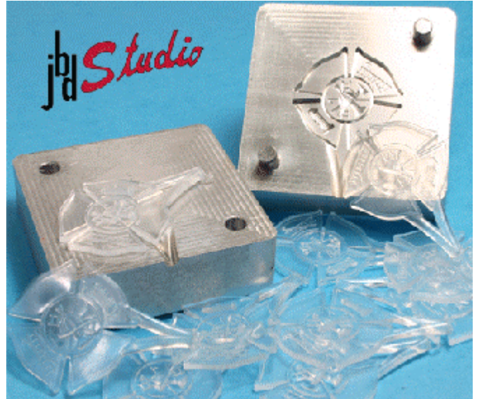
Jewelry Plastic Injection Mold

JBD Studio located in Yardley, in the suburbs of Pennsylvania is an industrial design house specializing in product development work, and prototype machining. The business relies heavily upon CAD\CAM for design, engineering, manufacturing, and communication. VisualMill is one of the principal tools in their collection.