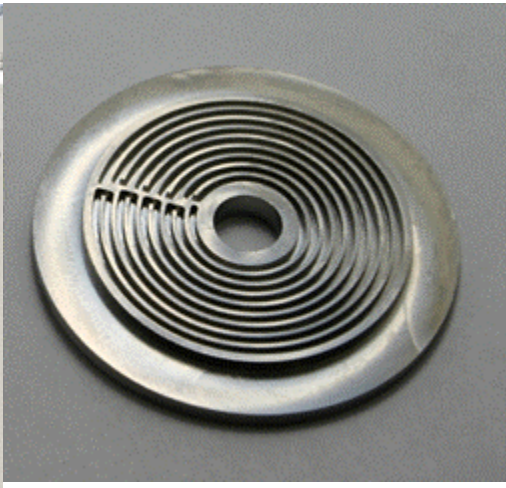
Micro machined titanium disc for aeronautical application