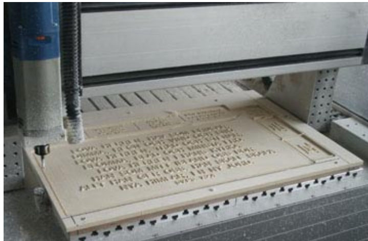
Figure 3 - The first pattern Rösengren created was this bongo sign, made to honor the rock stars who visited the Club Bongo in Malmö, Sweden, in the 60's. This sign is 105 cm x 70 cm x 1 cm and there are nearly 1000 letters. The sign was bigger than the machine's milling area, and had to be divided into three pieces and then put together.

Recently he produced his 2D component that was designed and manufactured digitally, the sign shown in figures 3 and 4. VisualMill's support of standard Microsoft Windows features and advanced V-carving functions made it easy for him to create the lettering used on the plate. What's impressive is that it was manufactured only one week after the CNC machine installed. Some of the patterns are CNC milled to a certain level and then finished by hand. "The combination of hand crafted patterns combined with CNC technology opens new possibilities," noted Rösengren.