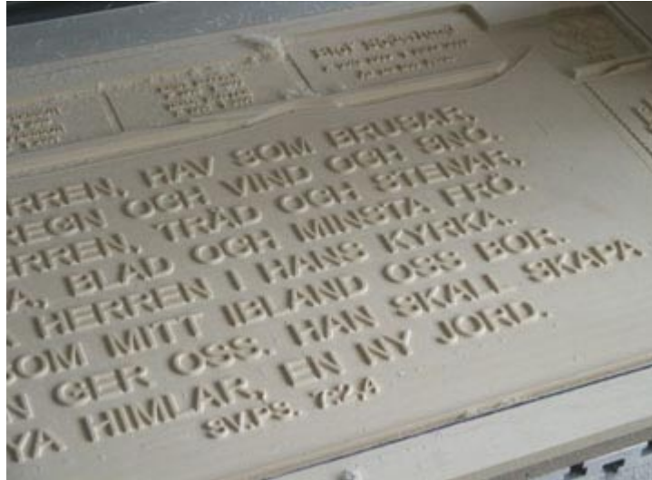
Figure 4 – Detail of the sign. In addition to V-carving employed here, Rösengren also uses 3-axis operations such as plateau milling.